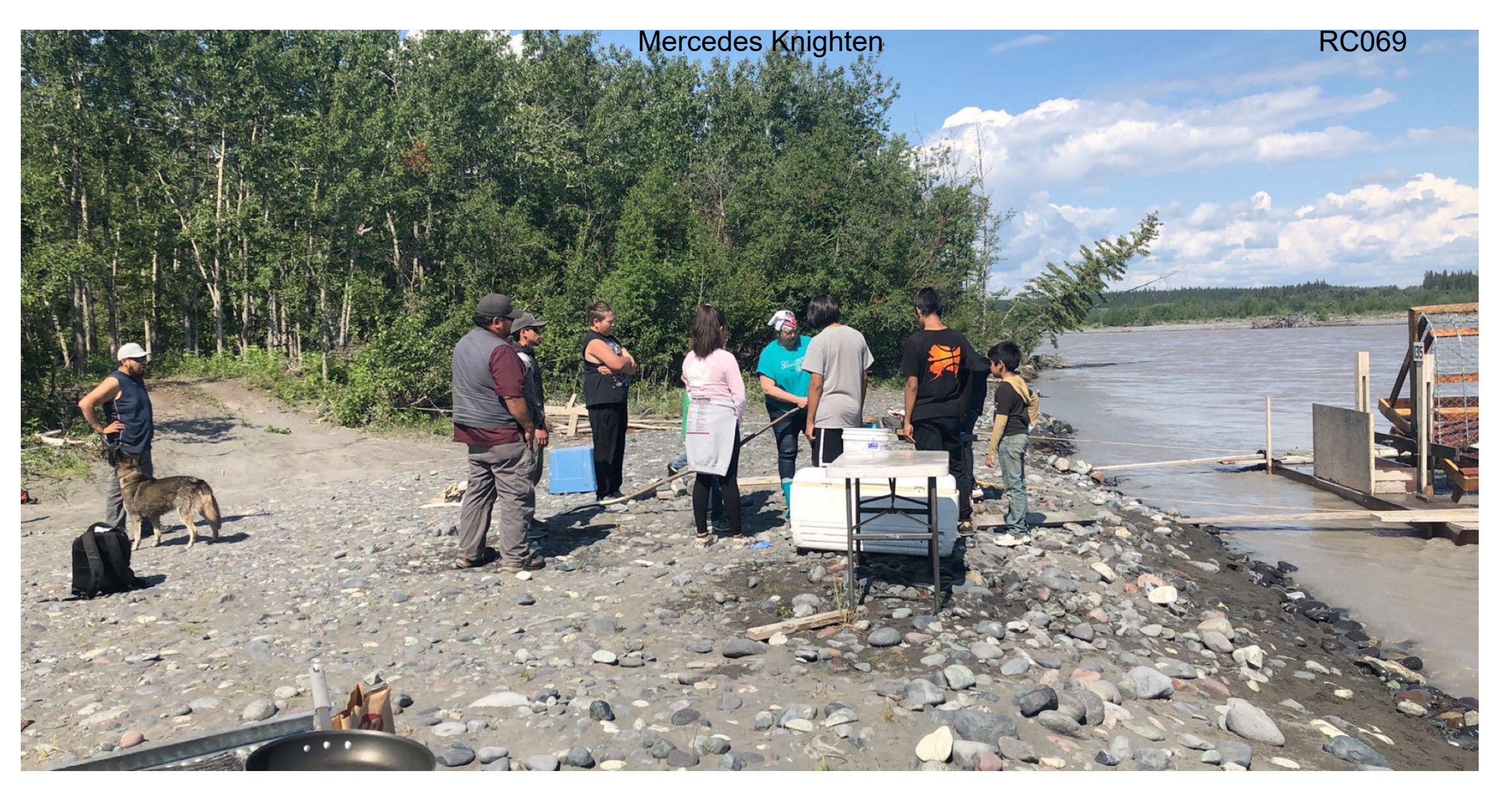
This is a wet box wheel the box is in the water